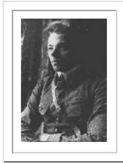
Antoine de St. Exupery

(You know you've achieved perfection in design, not when you have nothing more to add, but when you have nothing more to take away.)